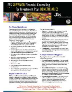
FRS Survivor Financial Counseling Flyer

Please note that this service is available to Investment Plan beneficiaries only.